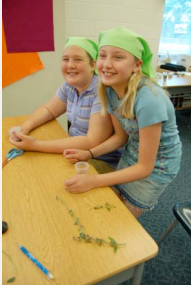
■ Making Soap