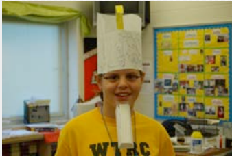
■ Costumes and clothing