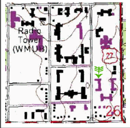
54. Farmstead Plan :